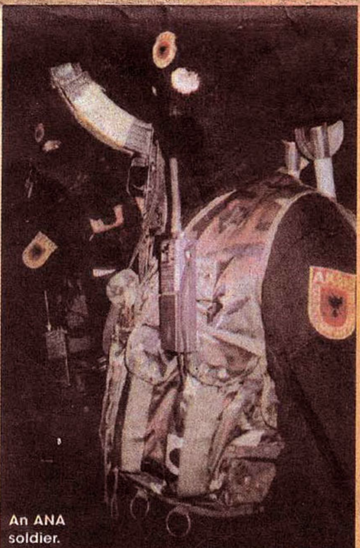
An ANA soldier.